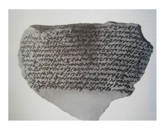
(A Letter from Abraham, dating back to the 7<sup>th</sup> century AD., found in site, excavated by the Egyptian Exploration Society)

The monastery of Phoibammon at al-Da \bar{i}r al-Bah \Box r\bar{i} quickly became the most important monastery in the western Theban area as it attested in the extensive corpus of Coptic documents from and concerning the site.